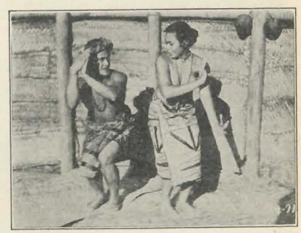
THE NATIVES BEGAN TO DANCE

"When the chiefs had their fill the remainder of the rum was passed around among the native gentlemen of the Kanakas tribe.