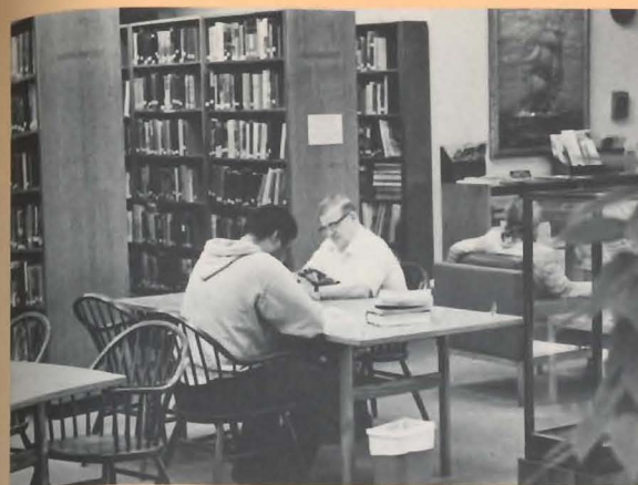
Two students in the Conrad library preparing for next day's classes.

course selection and productive study habits is available to all students.