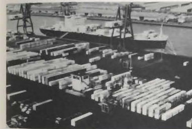
Aerial view of Port Newark/ Port Elizabeth, N.J., the world's largest container port.

"we know that we have a unique and critically important mission to the seafarers who come here, to the maritime industry of the world and to the health and well being of this port city."