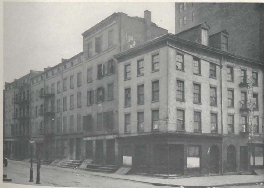
A view of the tenements and saloons which once occupied the site of the Institute's Annex Building at Front Street and Coenties Slip. When these were torn down in 1925 the Institute pioneered in slum-clearance by constructing a decent shore dwelling for merchant seamen.