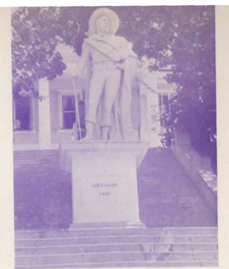
Statue of Columbus in Nassau.

"A Sailor Named Rodrigo" Images and/or text cannot be shown due to copyright restrictions.