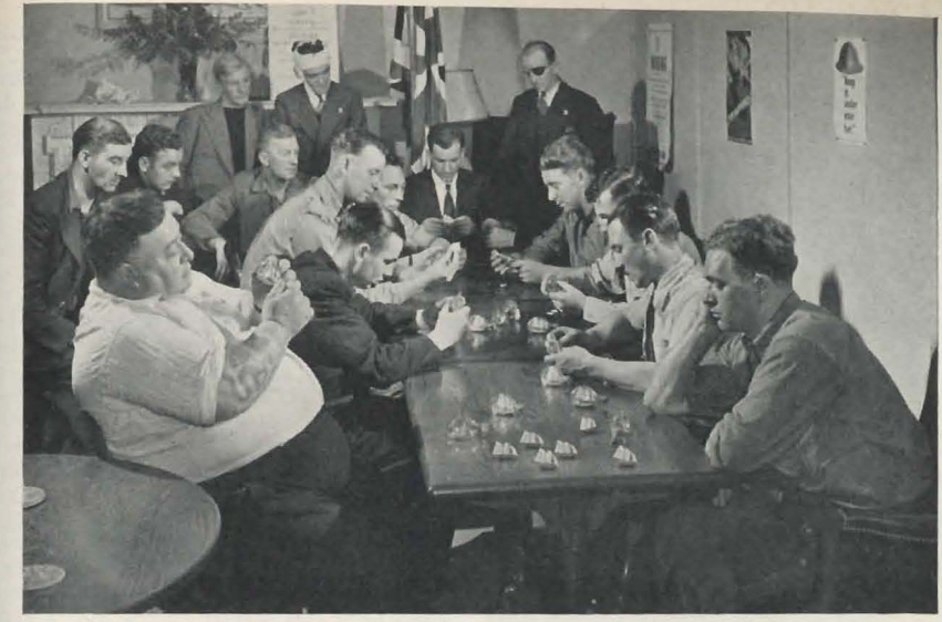
British and American Seamen join in making Ships-in-Bottles sold at 50c each for the joint benefit of Bundles for Britain and the Seamen's Church Institute of New York.

By Meyer Berger Images and/or text cannot be shown due to copyright restrictions.