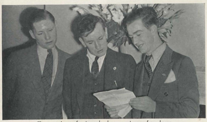
Three survivors of a torpedoed crew get news from home.

Please send contributions to the SEAMEN'S CHURCH INSTITUTE OF NEW YORK New York, N. Y. 25 South Street