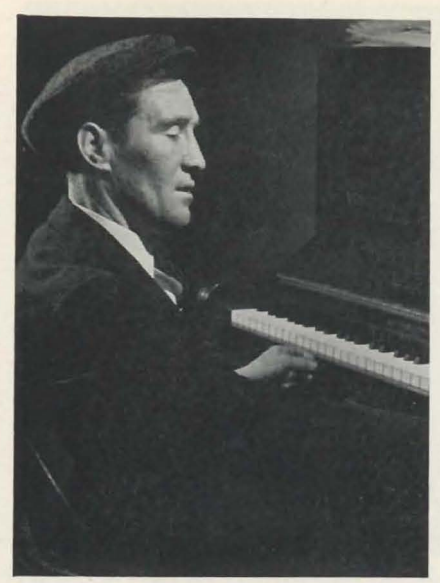
A British Seaman plays "Drumsticks" on the piano in the Merchant Navy Club.

only that part of 138th Street that stretches between Brook and Willis Avenues. There's a Scottish colony along that part of 138th Street and a man gets the feel of home. On Sundays the Bronx Scots go out to soccer and the convoy seamen take part.