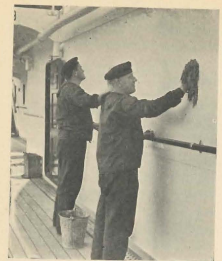
Rubbing down the walls of the "Bremen"—An inspiration for a poem?

Deckhands, wheelsmen, oilers, wipers, even captains, feel the urge to entwine dactyls, anapests and trochees into immortal verse, as witness these realistic lines penned by the gnarled hand of a weather-beaten seafarer: