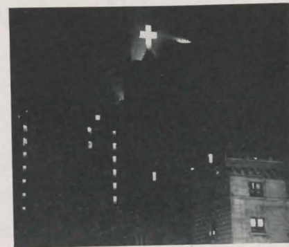
The Institute's Cross, Shining "Skyward and Seaward".

The romance of the sea is at sea, but stark realism, for the seafarer, is staged on shore. Here is his only freedom from rigid and essential discipline. Here perhaps he finds his unions, necessarily officered by veterans long away from the sea, being disrupted by insurgents able to stay ashore. He may find upon his return from a long voyage controversies, strikes, picketing initiated during his absence and himself the victim of intimidation before having an opportunity to learn the foundation facts of the problem. Ashore is "when a feller needs a friend," and we at the Institute, as your representatives, are such friends. Our green Titanic Tower light, and our gleaming white cross stand, like the Red Cross in wartime, for those in need, for the puzzled, the suffering, without prejudice as to nationality, religion or organization membership. Last year two strikes stirred up the waterfront.