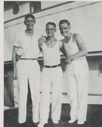
A Trio of Youthful Ship Apprentices.

Having solved the bunking problem I was astonished a few days afterwards to find both of them out on the t'gallant yardarm, 120 feet above the deck. "How long has this been going on?" I asked the Officer of the Watch. He smiled and said "I don't know, sir. I found them there when I took over the deck." I looked up, they waved at me and I thought, what can I do? They were completely masters of the situation? I never again bothered