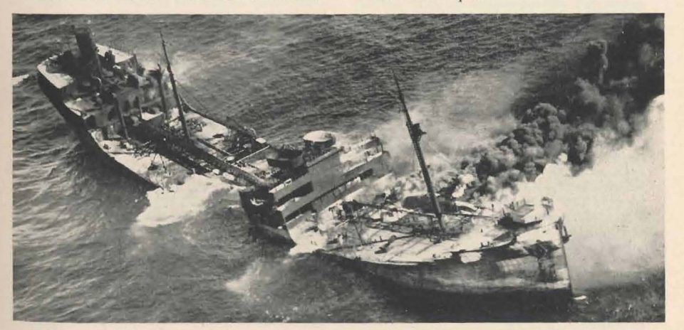
Scenes like this occurred with frightening frequency during this winter—the worst in a century.

"When the rest of the crew members, waiting for transportation home from the other side, heard what happened to us, they all decided to return on a liner. None of us is interested in getting mixed up with these freak storms, but if we have to, it feels a lot better to be on a ship bobbing around in the ocean, than on a plane in the same spot!"