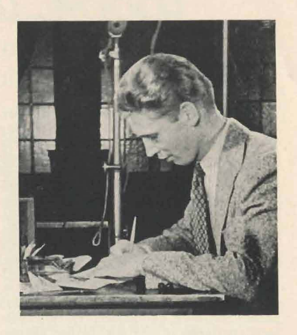
Glasgow S.W. 2