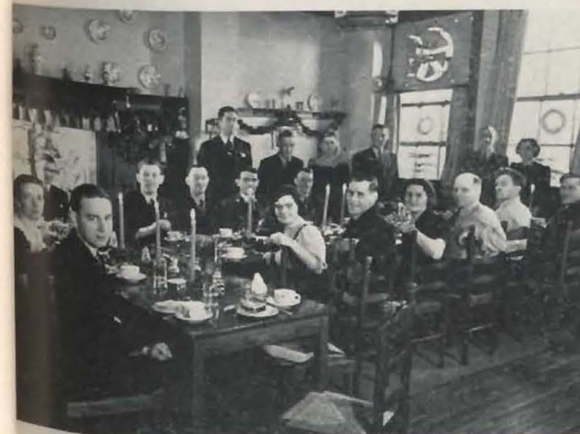
Dutch Seamen and Hostesses Enjoy Christmas Dinner in the Home for Netherlands Seamen.

Images and/or text cannot be shown due to copyright restrictions.