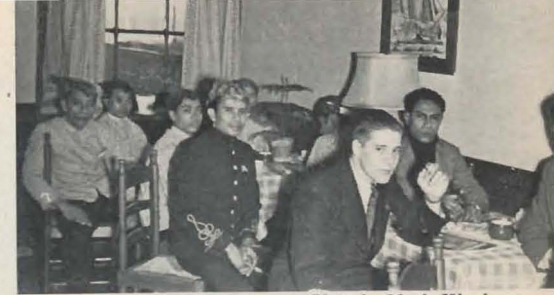
Seamen Waiting to Greet the Princess.