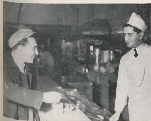
SPECIAL MEALS FOR CONVALESCENT SEAMEN

Pictured here are some of the services financed partially by Red Letter Day and other voluntary gifts