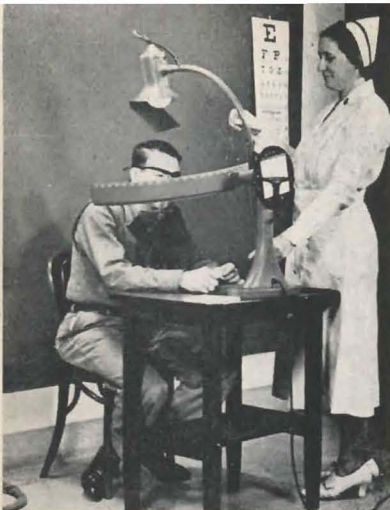
SEAFARER'S VISION TESTED IN THE EYE CLINIC