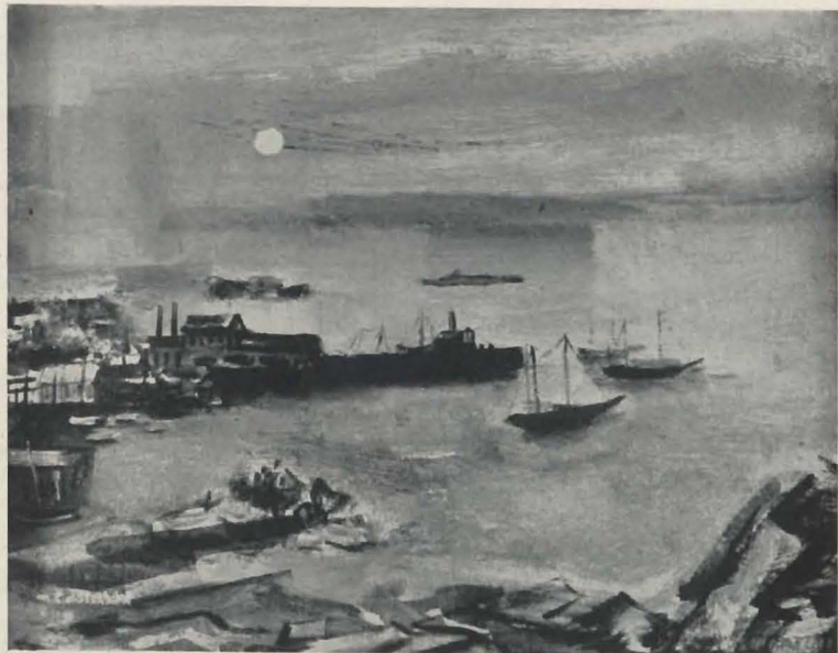
Exhibited at the Artists' Gallery DE MARTINI'S "ISLANDS IN THE SEA"