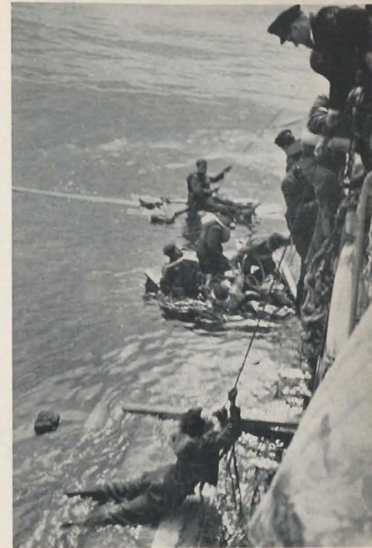
Survivors of a torpedoed merchantman are rescued at sea.

"When an officer was hoisted up, he could not see anything. The passenger was sure and soon we could all see the steamer and its smoke.