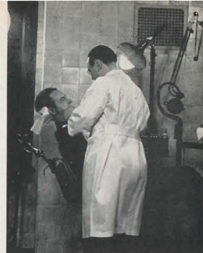
DENTAL DEFECTS CORRECTED IN THE DENTAL CLINIC

Fifty new Red Letter Day gifts would eliminate the budgetary fears as to continuing the essential welfare activities of the Institute for 1941. There are many holidays throughout the year which have not been designated. Or perhaps you would like to select a birthday or other special anniversary of some loved one.