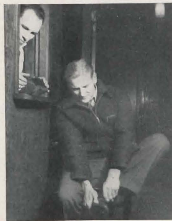
NEW SHOES FOR OLD IN THE SLOPPE CHEST

Pictured here are some of the services financed partially by Red Letter Day and other voluntary gifts