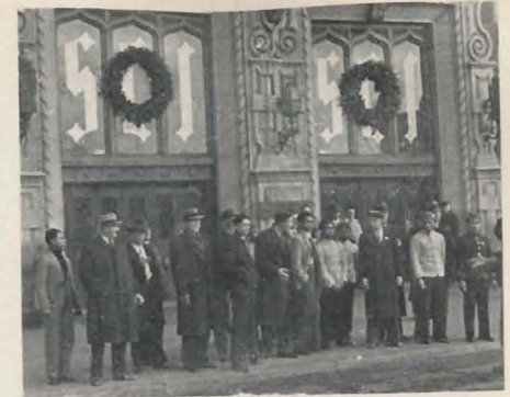
Dutch Seamen Waiting to Give A Christmas Welcome to Princess Juliana.

"The Germany airplanes drop a boom here, and a boom here, and a boom here, and a boom here."