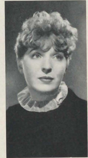
MISS INA CLAIRE

We have reserved the orchestra and mezzanine for the fourth night performance of a new play