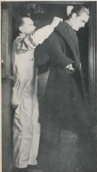
OVERCOATS FOR SHIPWRECKED CREWS

and we'll reserve YOUR Red Letter Day for you. You will bring untold happiness to thousands of seafarers who are so essential, both in peace and war, to our commerce and defense.