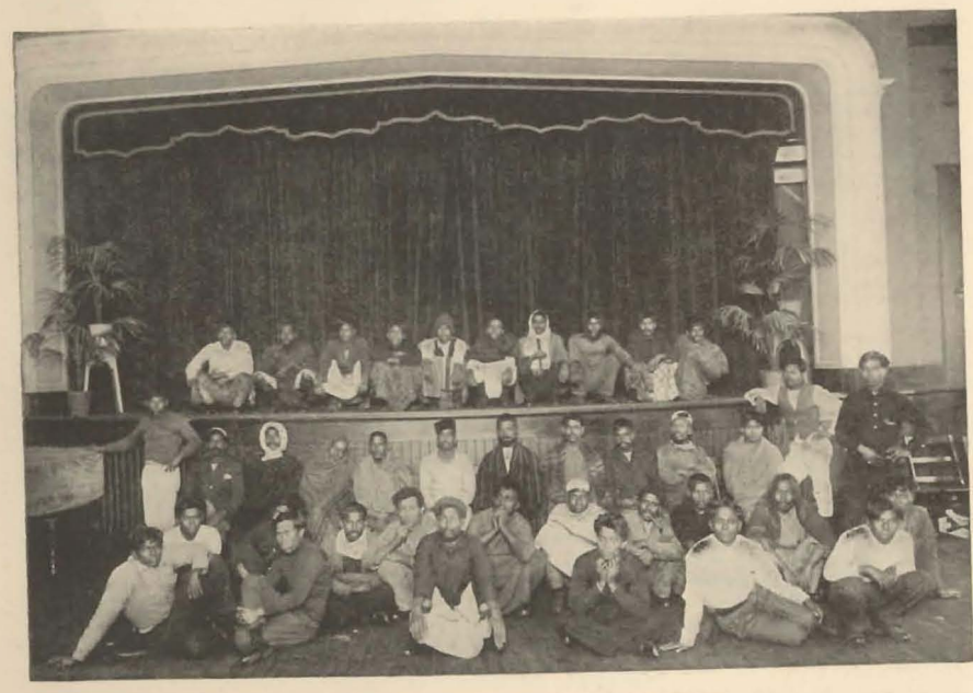
OUR MALAY AND LASCAR LODGERS From the Steamship Bolton Castle, which was seriously damaged by fire at her dock.

Much appreciation has been shown of the great variety of cheap combination meals furnished both at the lunch counter and in the officers' dining room. There have been 251,389 meals served at the lunch counter and 22,480 in the officers' dining room during the year. In addition, there have been 111,476 sales at the soda water fountain. We have averaged through the year approximately 750 meals a day, while the maximum number served at the lunch counter on any one day reached the high point of 1,241.