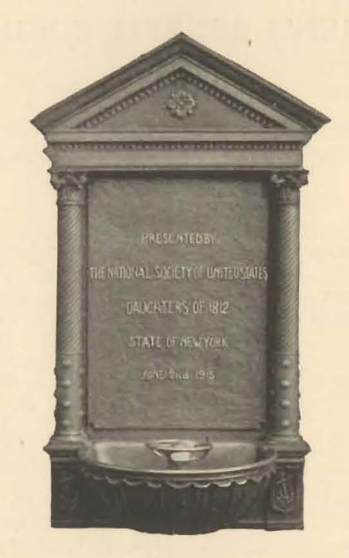
Out door Bronze Drinking Fountain.