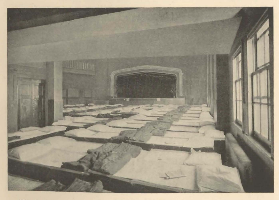
This shows in the auditorium 98 of the 209 Army Cots set up in the building to help meet the emergency demand made by the British Consulate General to take care of the crews which were brought to New York from the S. S. Appam.