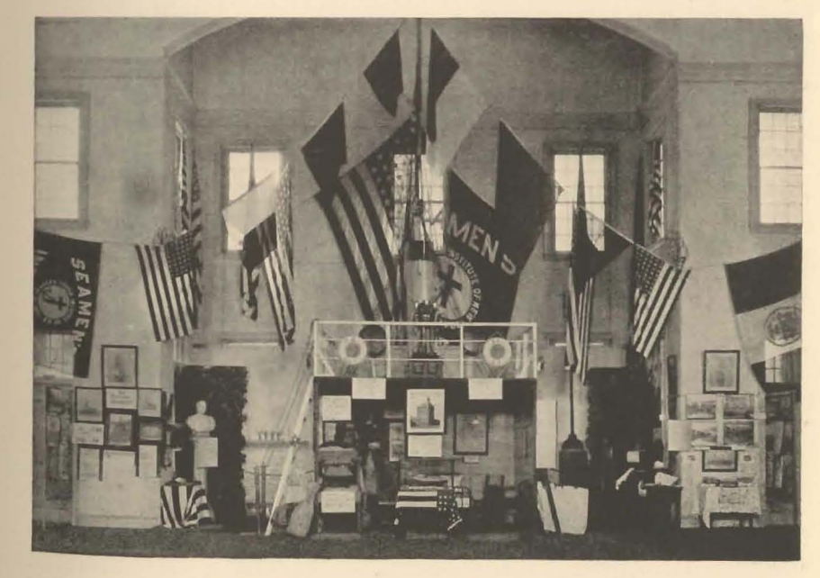
EXHIBIT OF THE SOCIETY'S WORK

Given at the Old Synod Hall, on the grounds of the Cathedral of St. John the Divine, during the 1915 Diocesan Convention.