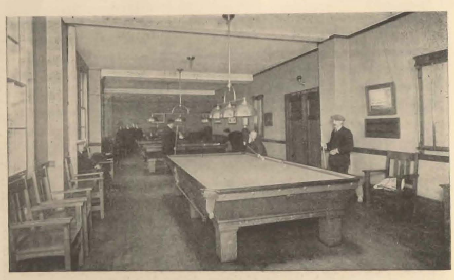
OFFICERS' READING, WRITING AND GAME ROOM

There were registered at the hotel desk during the year 169,059 lodgers, an increase of 5,995 over the previous year, and an average of 463 nightly. This means that the lodging department has been utilized to nearly 90% of its capacity throughout the year. In addition to this lodging work there were handled at the hotel desk and through the North River Station Post Office 34,546 pieces of mail for seamen, an increase of 9,604 over the preceeding year.