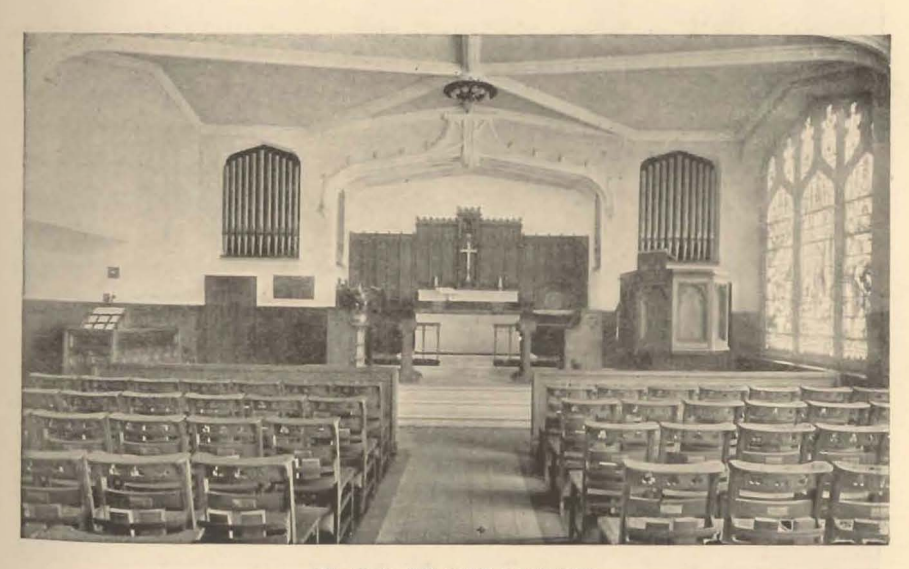
CHAPEL OF OUR SAVIOUR

During the year a total of 453 religious services have been conducted at the Institute Chapel of Our Saviour and the Church of the Holy Comforter.