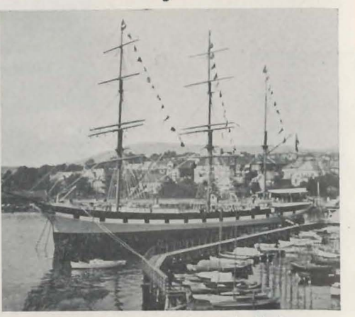
A View of the Lingard in Oslo Harbor

The Norwegians are proud of their Viking ancestry and they could not allow the Lingard to become a coal hulk, to rot out her days in menial work. So, after the steamer collision, public demand made it imperative that the old ship be brought home. (She was built in Norway are not content to relegate sailing