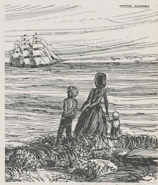
Drawing by Charles Vickery

Above little South Sea islands the world has passed by.