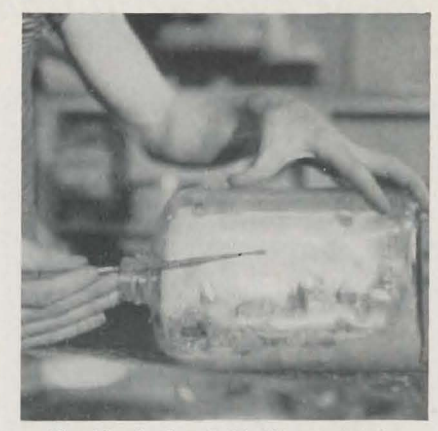
The Hands that Build Ships in Bottles

"Whatsoever thy hand findeth to do, do it with thy might." Eccles. 9: 10