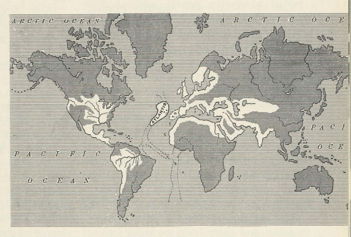
One of the earliest maps of Atlantis, with its islands and connecting ridges, from deep-sea soundings. From book ATLANTIS, The Antediluvian World, 1882