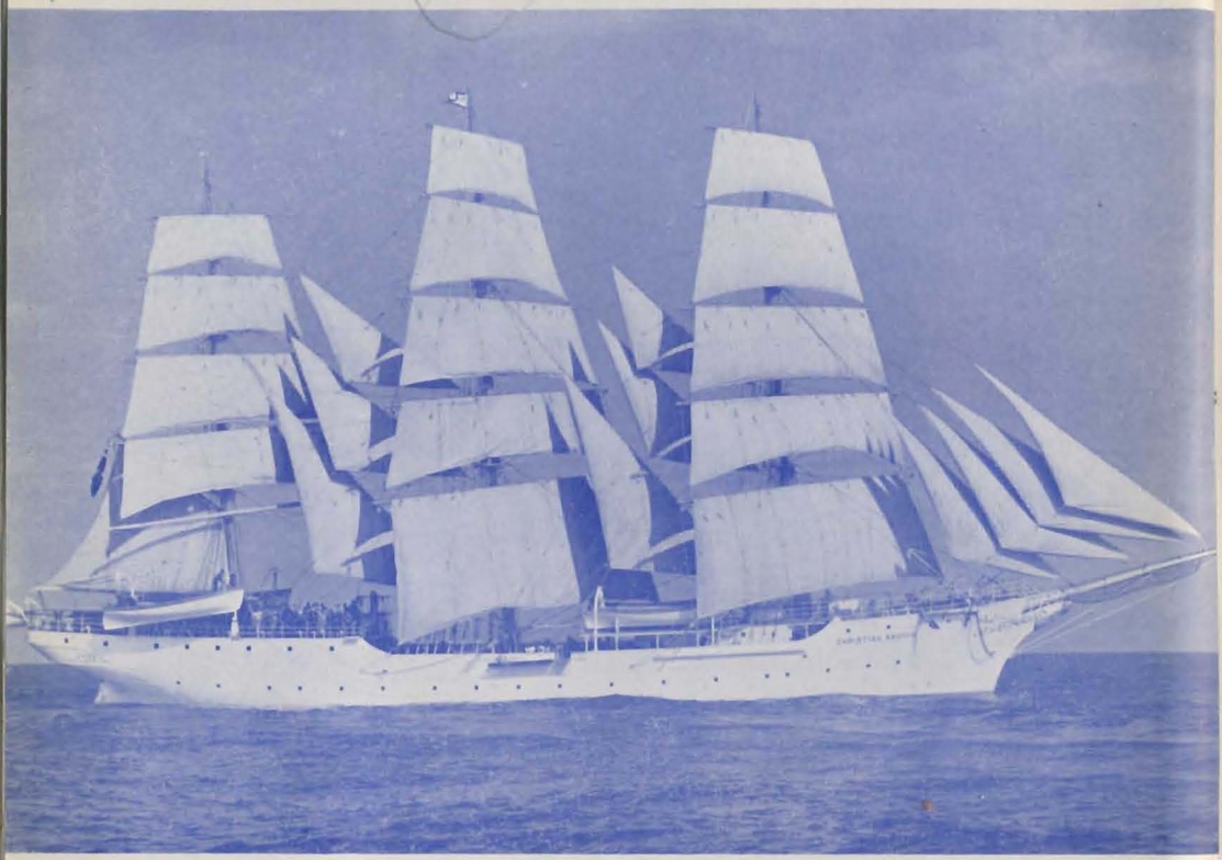
The Schoolship "Christian Radich"

Reprinted by courtesy of "Syren and Shipping"