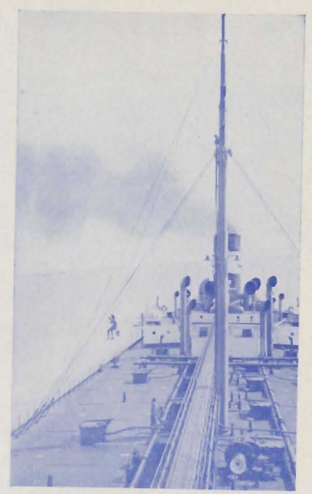
Fighting corrosion, a seaman in a bos'n chair, tarring a stay

A tanker is really three kingdoms in one and the third is ruled by the Chief Steward. Under his supervision the chief cook, in spotless white, presides in culinary splendor over his gleaming pots and pans. Constant activity and sea air give a