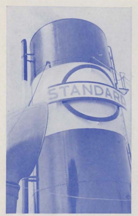
The camera finds beauty even in a tanker's funnel.

TANKERS, despite their oily freight, are among the cleanest, neatest vessels affoat. But the nature of their cargoes and the unending assault of briny water, wind and sun create continuous work for seafaring hands.