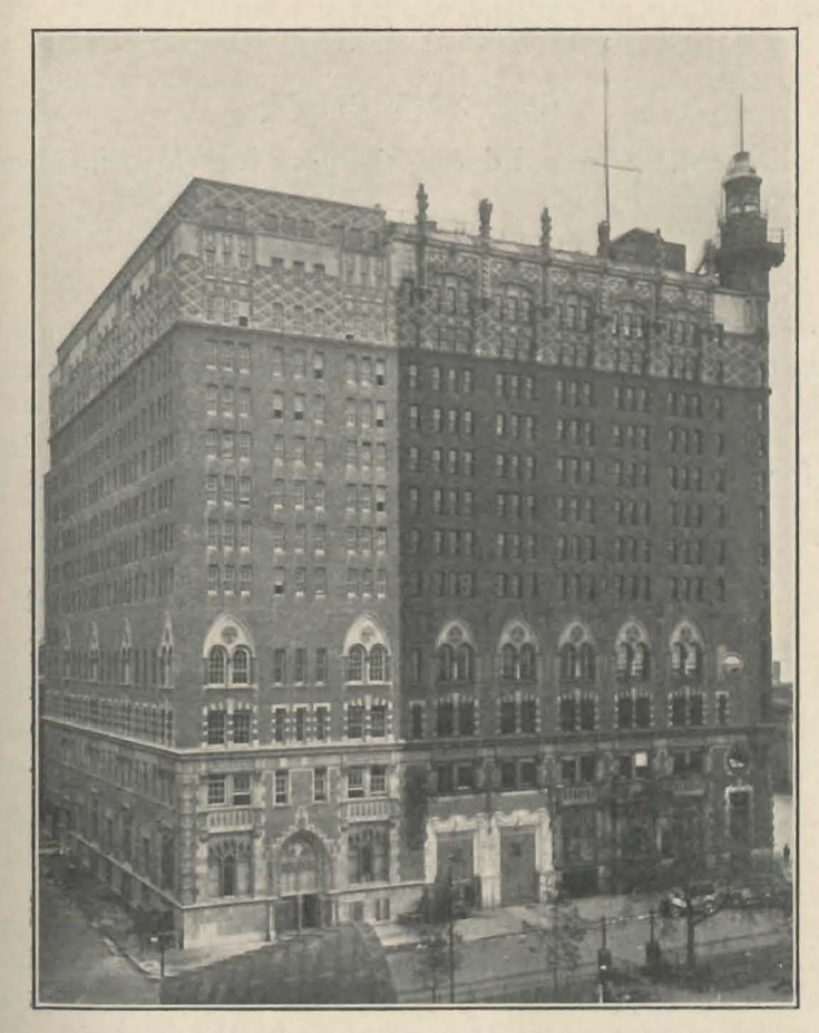
THE PRESENT BUILDING OF THE SEAMEN'S CHURCH INSTI-TUTE OF NEW YORK COMPLETED IN 1929 IS LOCATED ON THE EAST RIVER AT 25 SOUTH STREET