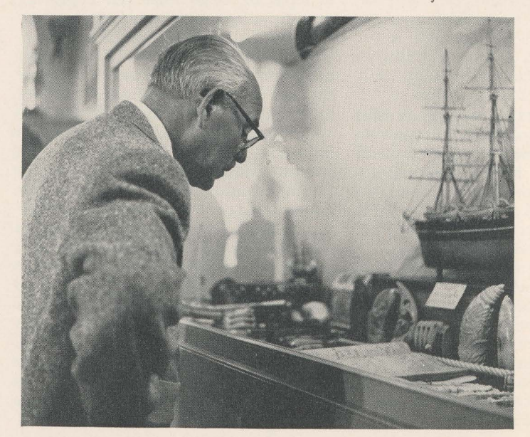
Above: Girl Scouts on the Institute's Roof head for a closer look at the Titanic Lighthouse Tower. Left: The Marine Museum's exhibition of scrimshaw merited some serious scrutiny.

Most of the guests left with a promise to themselves to come back and stay longer when they had more time.