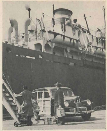
The Institute's Ship Visitors deliver books to ships flying United Nations flags.

(Please send your books to the Conrad Library, 25 South Street.)