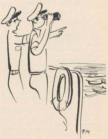
Drawing by Phil May

Reprinted from Polaris U.S. Merchant Marine Academy, Kings Point, N. Y.