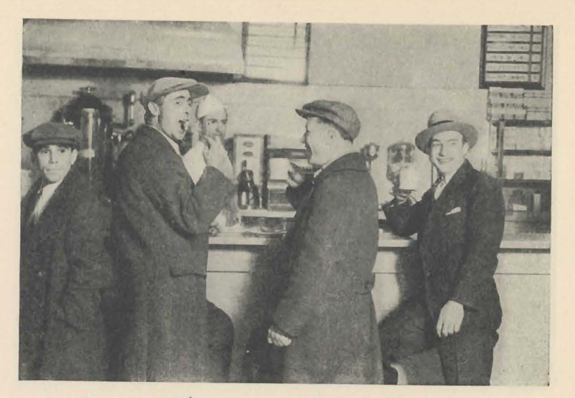
996,766 sales made at the soda fountain.

those desiring to do so may repay the amount of the loan. This policy is more and more appealing to the man who desires to be self-respecting and self-supporting, as is demonstrated by the fact that many men have already repaid their loans. Of course many do not. Relief in the form of lodgings, food, carfare, clothing, etc., has been given to 10,992 men. Nineteen per cent of the loans have been returned.