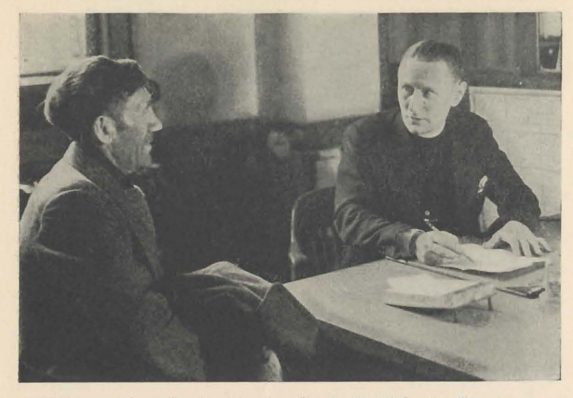
85,129 special needs administered to by the Social Service Department.

of our needs and should be credited with nearly $23,000 for the year which has been received in answer to appeals through that agency. Our three Chaplains conduct regularly appointed Services in the Institute Chapel, and in the recreation rooms of Marine Hospitals on Ellis Island and at Stapleton, Staten Island. They have officiated at 98 funerals, 13 weddings, and have baptized 18, and have made hundreds of visits to hospitals, jails, vessels, etc. 2,861 inquiries have been received about Missing Seamen and 401 have been located. The Entertainment provided this year, Talkies, Vaudeville, etc., has done much to keep up the morale of the men.