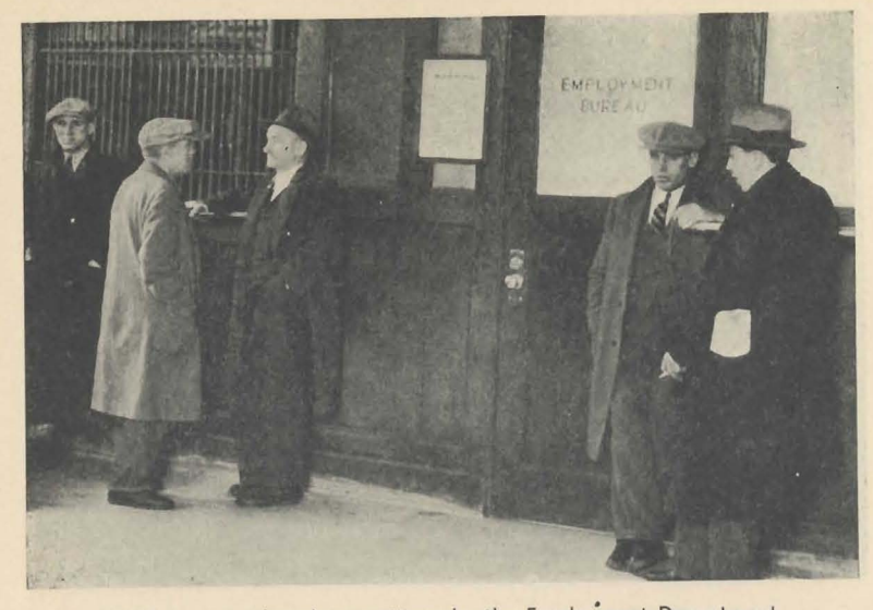
4,467 seamen placed in positions by the Employment Department.

and the discipline has been better than in any previous year, and this in the face of insistent and carefully premeditated attempts on the part of Communists, I. W. W.'s and other radicals to create discontent among the seamen patronizing the Institute.