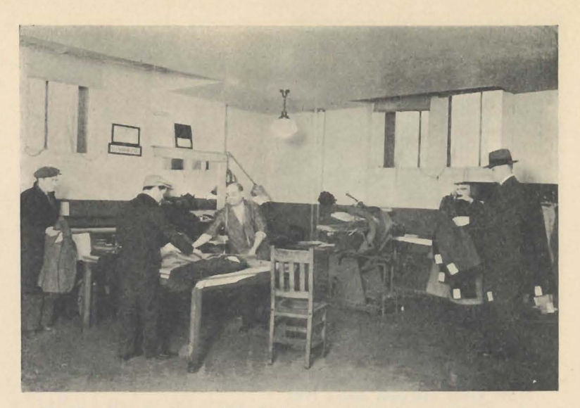
38,686 seamen made use of the barber shop, tailor shop and laundry.

men's Funds Department, an increase of 805; $609,115.45 deposited, an increase of $1,751.10. There were increases in the number of transmissions and the amount of money transmitted. There were gratifying increases in the statistics of the Merchant Marine School.