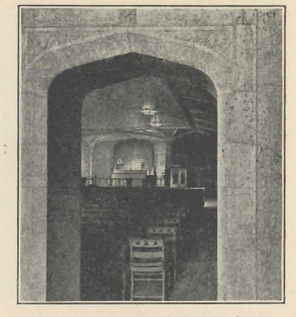
13,016 seamen attended 214 religious services.

have a staff of over 260 employees as against the nine who did the work in 1895. To properly maintain the building as to replacements and structural upkeep requires a very large sum annually. All of this is only made possible through the continued assistance of our loyal contributors, and only through their increasing aid can we come through 1931 without a deficit, because the legitimate demands of the unemployed seamen showed a continual rise through the latter part of 1930 and unquestionably will show the same through 1931.