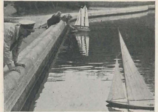
Seamen Enjoy Sailing Model Yachts on Conservatory Lake