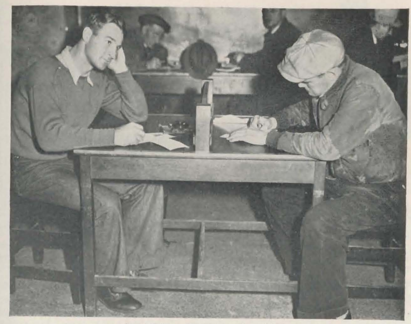
Our Writing Room Is A Busy Place

If I were less, this last hour day Would breshy heart; If I were is to tread a home-lingtreet Alone-apon And watch Il houses being mail Ready for it: A door closs a shade drawn de between Me and the lit I could not it-I would katoo well What lies in: The lamp ables spread, the goodern food, The merry Of home-ofamilies together re! I know hover And intim he pictureall the ms Would be clear: The animo oices—the bright o Of silver of glass . . . If I were bless on a night lines, I could no race Noll Crowell Parent's leine, Dec., 1934