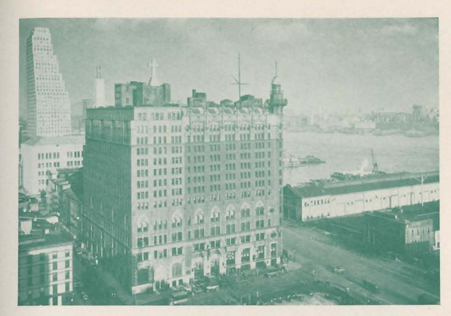
Summary of Services Rendered to Merchant Seamen By The