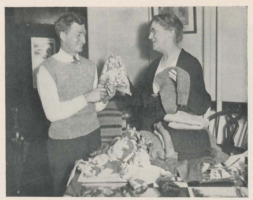
Mother Roper Gives A Seaman A Comfort Bag

SEAMEN appreciate the efforts of those generous citizens who provide a shore home for just such homeless seafarers... They enjoy the comforts and facilities offered at the Seamen's Church Institute of New York and say a blessing for those who made all this possible.