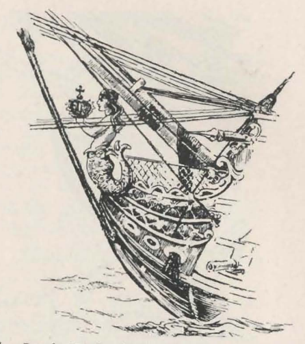
The Dutch "Hollandia." A famous flagship of the old Dutch Navy

Figureheads in the earliest historic times seem to have been sacred emblems borne on board ships to ensure good luck and avert the perils of the sea. Egyptian sculptures give numerous vessels with heads of the Sacred Ram of Ammon, or Ibis heads at the prow, and we read that images representing the mystic Cabiri—divinities who special power of protecting mariners rom storm and shipwreck—were similarly