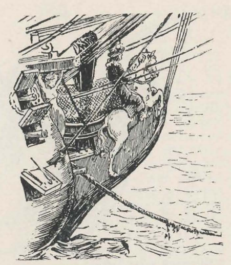
The "Royal Charles" Charles II's famous flagship captured by the Dutch in the Medway, 1667

figures of the demi-gods in the act of being transformed into bulls.