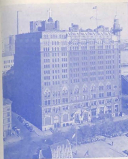
Safe Anchorage Ashore at "25 South Street".

Cape Horn, where the Atlantic and Pacific meet, has always been a terror to seamen sailing round it. It is situated at the southern end of South America, on a Chilean island. Not many people know that its name was given by a Dutch navigator, Schouten, who discovered the cape in 1616 and named it after his birthplace, Hoorn, in Holland. The reason why men who have made this voyage are proud of it is that it is such a perilous place—heavy gales and dangerous steep black rocks rising to a height of 1,390 feet. A forbidding picture, as they describe it, and nearly always freezing cold. As one mariner put it: "To be frozen is sheer misery; to be sleepy is sheer misery, too. But to be both frozen and sleepy — as we struggled with 'Cape Stiff' — as oldtimers call Cape Horn — was indescribable torture. The worst cry of all usually came at midnight: 'All hands reef the foresail.' Up we would go, wearily climbing aloft, our frozen fingers trying to get hold of Number One canvas. Hour after hour we would struggle with the sails until we had no more fight left in us." Seas are amazingly high when near the Horn; they have been recorded as reaching a height of 60 feet and over 550 feet in length.