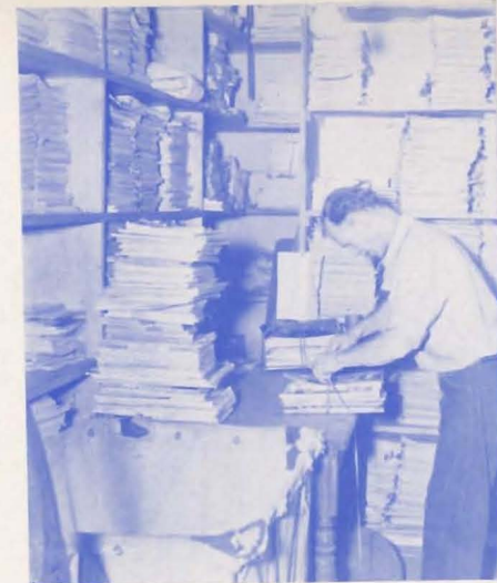
28,699 Books and Magazines Distributed to Seamen January 1st to July 1st, 1937.