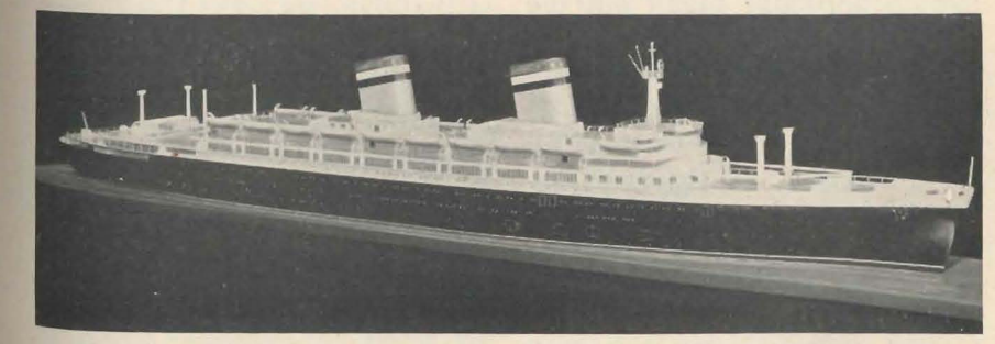
60,000 ton Super-Liner United States, being constructed for the United States Lines as a super-passenger ship. In emergencies such Merchant Marine vessels are converted into troop transports (as were the S.S. America, Manhattan and Washington in World War II).

So that we may continue to offer this opportunity for a decent shore home to literally thousands of seafarers, will you please help us continue our "program of friendship"? We appreciate your loyal and generous support.