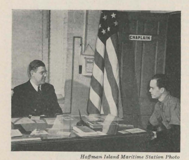
Institute Chaplains Visit Seamen in Hospitals and give Religious Counsel.