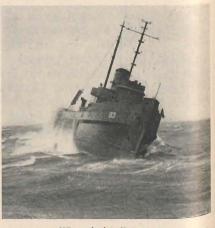
"Dead ship" in tow

There were some good sailors aboard . . . the Skipper, Mate, First Ass't. Engineer, Bosun and an A.B. were seasoned seafarers. But a number of the working crew were Portuguese who had signed on without previous sailing experience in order to work their way back home. They were dismally seasick during the storm and prayed fervently for rescue throughout the ordeal. One of them, on stepping ashore in Charleston, knelt down and kissed the ground in his emotion.