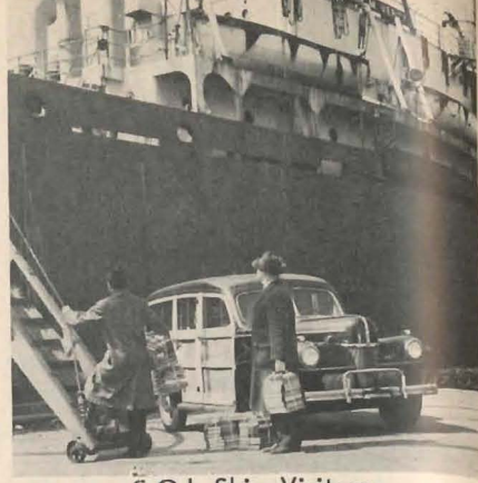
S.C.I. Ship Visitors

Bowling along with their station wagons piled with stacks of books and magazines, with their bulging briefcases and voluminous papers, the Institute's Ship Visitors forge a link between landsmen and the sea. Roving business men, official greeters and well-wishers, they represent the Institute's successful opposition to unscrupulous seaport leeches.