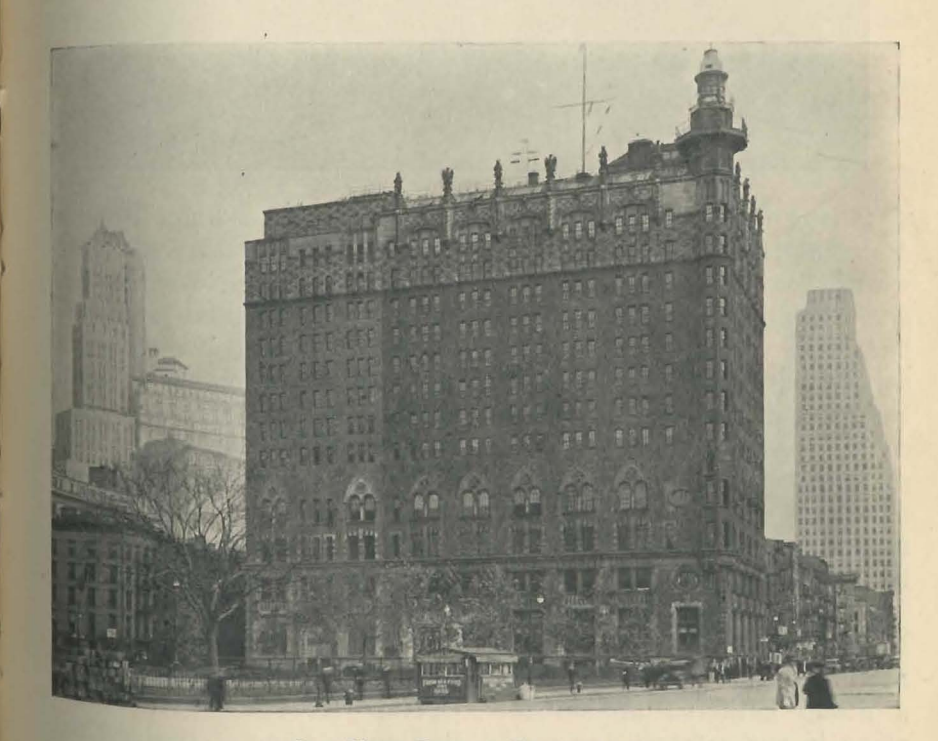
OUR MOST RECENT PHOTOGRAPH

is our own Institute on Coenties Slip, a most imposing building in the district. Although South Street is changing and New York's skyline is soaring, there will always be a place for seamen where they will feel at home—and that place is within the portals of "25 South Street." We shall keep pace with the changes, as saltiest South Street succumbs to skyscrapers, but our goal shall ever be "Safety, Comfort and Inspiration" for the men of the sea.