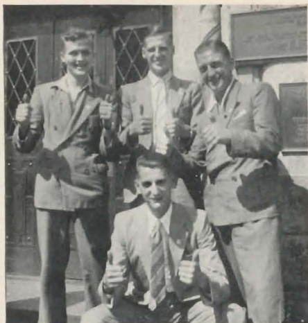
Torpedoed seamen of British freighter "Ena De Larrinaga" say "Thumbs up!"

and eventually may require an expert in admiralty law to decide which crew won the bet. The two boats separated after six days since traveling alone might lead to an earlier rescue. Four days later one boat sighted the Brazilian freighter Almirante Alexandrino . The nineteen seamen were rescued and taken to the mainland.