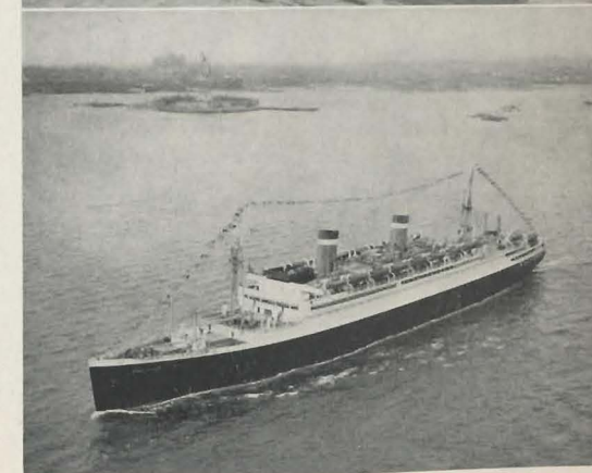
Reading from top to bottom: SS. AMERICA, SS. MANHATTAN, SS. WASHINGTON.