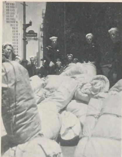
Hundreds of sea bags piled at the rear entrance to the Institute block traffic as Coast Guardsmen arrive.