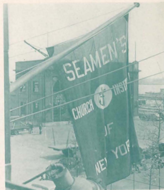
The Institute's house flag flies over the main entrance to "25 South Street"