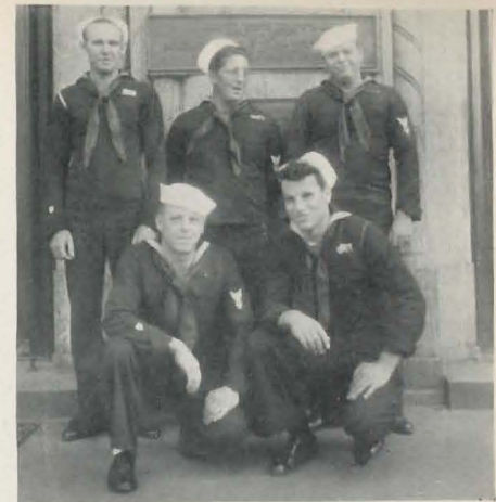
A Group of U. S. Coast Guard men at the Seamen's Church Institute of New York while awaiting orders to take over merchant ships for the U. S. Navy.

The Institute is glad that it is so equipped that it can help in defense work and we are sure that our contributors will support the decision of the Board of Managers to make available our facilities to men of the Army as well as the Coast Guard and Merchant Marine. We know that our friends appreciate that the indispensable, intangible element in our national defense is Morale . To quote General George C. Marshall, Chief of Staff of the U. S. Army in appealing for proper recreation facilities for the Army: "No matter how fine your equipment, no matter how abundant, if