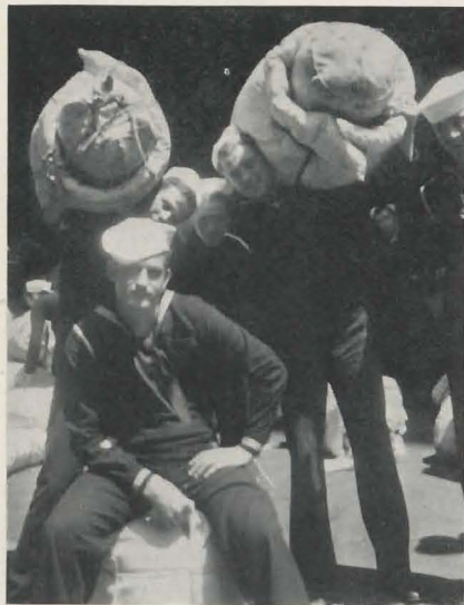
Coast Guard sailors carry their "donkey's breakfasts" into 25 South Street, but do not have to use them as the Institute beds are very comfortable.

Applying this also to our merchant marine, sea power is useless without man power, and man power however well trained, cannot function without good Morale . We are proud of our merchant service and know that it is running the risks