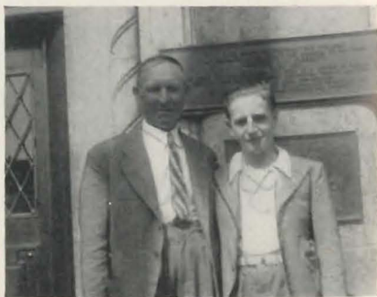
Oldest and youngest members of the crew of the "Ena De Larrinaga"—bos'un and cabin boy.

Special entertainments were provided the crew of the Ena De Larrinaga at the British Merchant Navy Club on the second floor of the Institute and they enjoyed the moving pictures in the Auditorium. The English Speaking Union also gave them a party in their headquarters at Radio City.