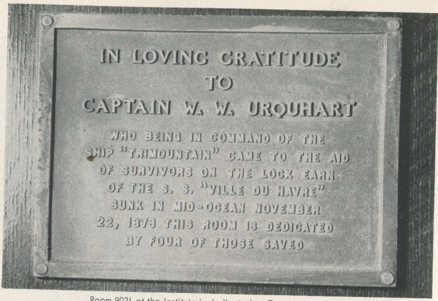
Room 903L at the Institute is dedicated to Captain Urquhart.