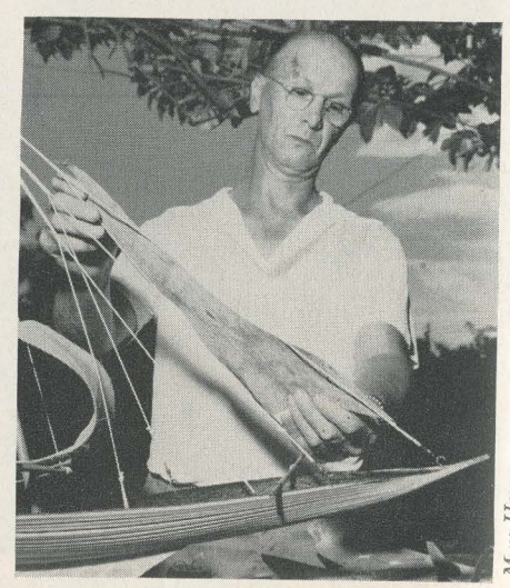
. . . and now it's a sail!

It's easier, however, to collect the smaller coconut palm spaeths, inasmuch as the tree is more widely and easily grown in southern Florida.