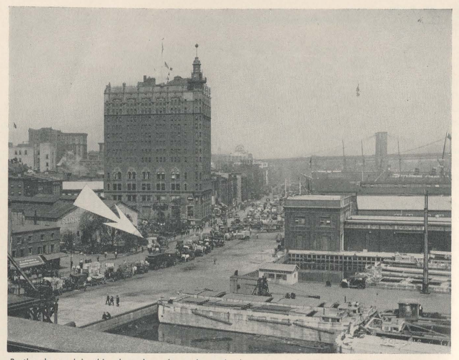
Partly obscured in this photo by a horse-drawn lumber wagon, the Coenties Slip Clam Bar (arrow), served a bustling neighborhood in the days of World War I.