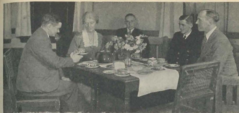
Tea Time in the Apprentice Room