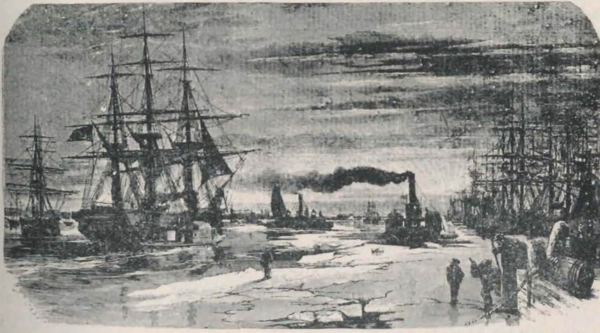
Reproduction from Harper's Weekly, Feb. 8, 1862. The Ice-Blockade—A Taste of Arctic Weather

There is, however, one other solution: if enough of those who already give, will increase their annual donation our financial worries will be solved. On page 10 of this issue of THE LOOKOUT you may read about an Institute friend who increases his contribution $5.00 every year. He began doing this twenty-four years ago and advocates it as a new "rule" for longevity! Why not try it?