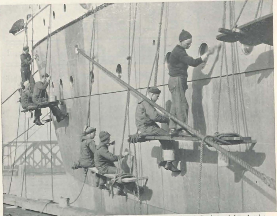
Seamen Painting a Ship's Hull

ships-on shore leave. You would The able-bodied seamen whom we probably never recognize them as call "A. B.'s" usually wear dungaseafarers except for their weather- rees of blue denim or overall cloth beaten complexions and their rolling gait. For they wear regular landsmen's clothes. At one time, not so many years ago, merchant seamen used to wear a species of bell bortoms, also double-breasted pea jackets and pilot caps, and they were very easily recognized by the canvas duffle bags they invariably carried on their shoulders. Nowadays, things are different. The men of the merchant marine just off their ships come to the Seamen's Church Institute of New York and check their baggage comprised of Gladstone bags and smart leather valises. Men of the merchant marine service wear white or blue uniforms only on board their ships. Ashore, they