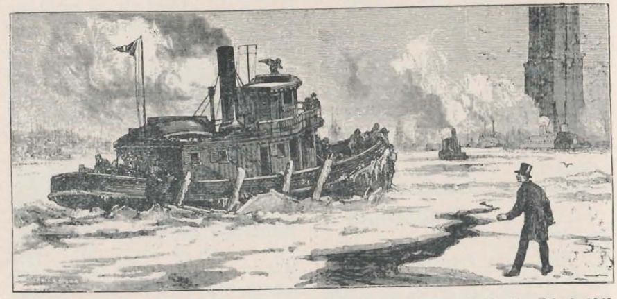
Reproduction from Harper's Weekly, Feb. 8, 1862 The "Cold Snap" in 1862—Ice in the East River

"A chill no coat, however stout Of homespun stuff could quite shut out, A hard, dull bitterness of cold . . . . . . What matter how the night behaved? What matter how the north-wind raved? Blow high, blow low, not all its snow Could quench our hearth-fire's ruddy glow." —Whittier's "Snow-Bound"