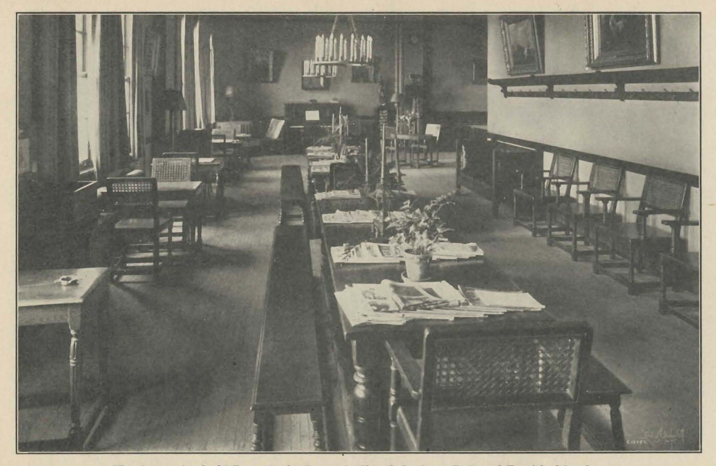
The Apprentice Lads' Room in the Seamen's Church Institute, Built and Furnished by the Seamen's Benefit Society.