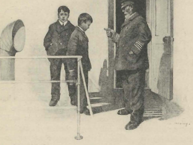
I've Two Young Rascals Aboard My Ship

Luckily nobody was washed overboard. We had to lighten her by dumping 2,000 cases of oil overboard. We did not need any elevators then, as we had only to sit on the deck and get washed along, using your sense of feeling as to when to stop. And if there happened to be any plumb-lines handy, why, you just only had to grab one and hang on. Luckily