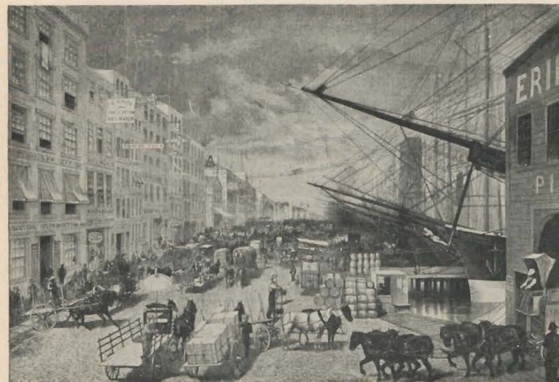
South Street 1878

Kindly send your contribution to the SEAMEN'S CHURCH INSTITUTE OF NEW YORK 25 SOUTH STREET, NEW YORK