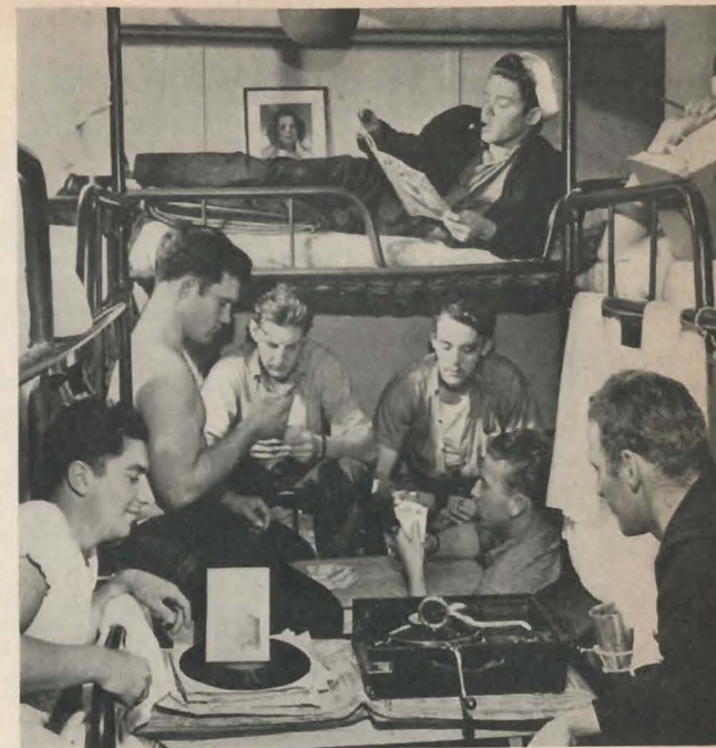
A typical f'c'sle scene. In this busy spot sailors read, write letters, play cards, listen to victrola records. Some even write poetry!

Here's to the Merchant Navy Good luck to all of you You are all doing your duty Sailing on the Ocean blue. You have seen your ships go under You have lost your shipmates too But you have the pluck and the guts Gee, we are proud of you. He wears a badge—a silver V And fights for freedom of the sea When I see a sailor I tip my hat For he's a man and a real one at that.