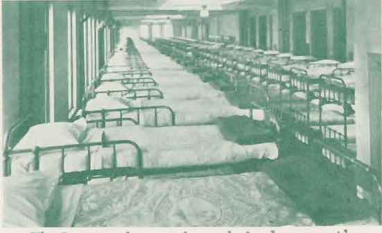
The Institute desperately needs funds to provide 500 free lodgings each night.

ONE of our contributors who has taken a Red Letter Day every year, has written us, when sending this year's check: "My gift to the S. C. I. always is sent from my heart. I cannot quite explain it to myself. It is partly from loving memories , whose birthday my gift commemorates. But that does not explain it all. I think it is a mystery . . . like the sea." And another friend writes: "Nothing but actual destitution would ever make me forego the pleasure of drawing a cheque for the modest sum, that, in the hands of the wonderful administration at 25 South Street, is multiplied to an almost unbelievable extent, in the service of those 'who go down to the sea in ships.'