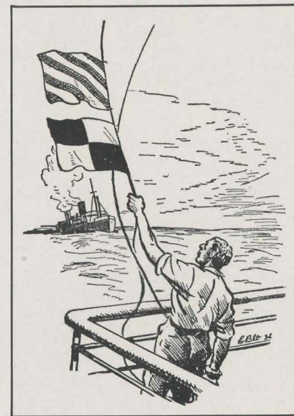
Reprinted from TUGBOAT. See page 12.

When the S. S. Manhattan is about to sail from her pier, she flies from the foremasthead a flag called the Blue Peter (blue border and white center), which means: "All repair on board. I am about to sail." This flag is lowered after the ship starts to move, and curiously enough, if the Blue Peter is