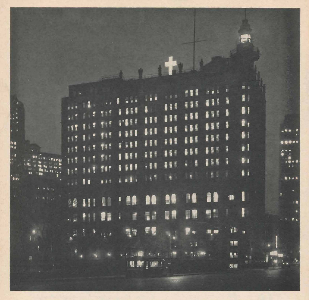
THE SEAMEN'S CHURCH INSTITUTE OF NEW YORK 25 SOUTH STREET, NEW YORK 4, N. Y.