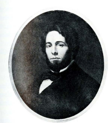
HERMAN MELVILLE CIRCA 1847

Moby-Dick was first published in London where it was acclaimed as a masterpiece. But the London reviewers were quick to call it a fraud: "No American ordinary seaman could write like this," they claimed. How wrong those English critics were! The American seafaring tradition is a remarkably literary one, replete with such sea-going