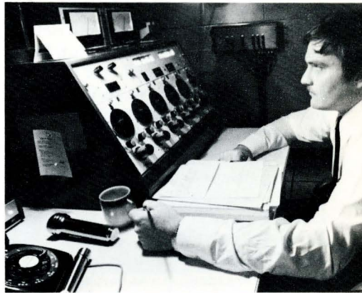
Student at MARAD Radar School located at SCI

Unheeding of the grim horizon far That may or may not light up with a star.2.