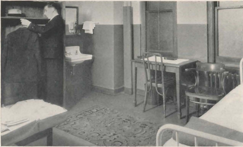
A Typical Institute Bedroom

D INGY freighters wallowing in tempestuous seas with cargoes of nitrate from Chile, cotton goods from Manchester, silks from China, motor cars from the River Rouge, tobacco leaves from Macedonia, "ivory, apes and peacocks" from the "palm green shores"—what you will—that is world commerce. That and pages of tabulations (in long tons, 000's omitted) is the commerce that builds cities, feeds nations, propagates factories.