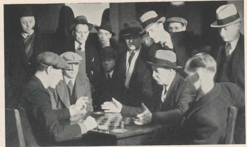
A Busy Corner of an Institute Game Room

W HEN ashore between voyages or when ships are tied up thousands of these sailors find a haven at the Institute. For 89 years it has befriended seafarers, serving as their home, hotel, club, church and providing them with the friendship and protection they so greatly need. Since January, 1927, the Institute has been able to welcome thousands more than it did before the Annex was completed. This thirteen-story addition to the original building is filling a real need. It contains reading and game rooms, an Auditorium, a cafeteria, besides eight floors of dormitories and rooms which are always well patronized.