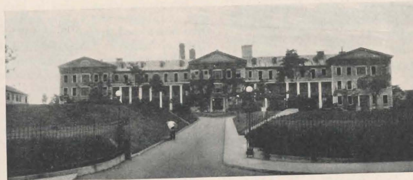
U. S. Marine Hospital at Staten Island, N. Y.